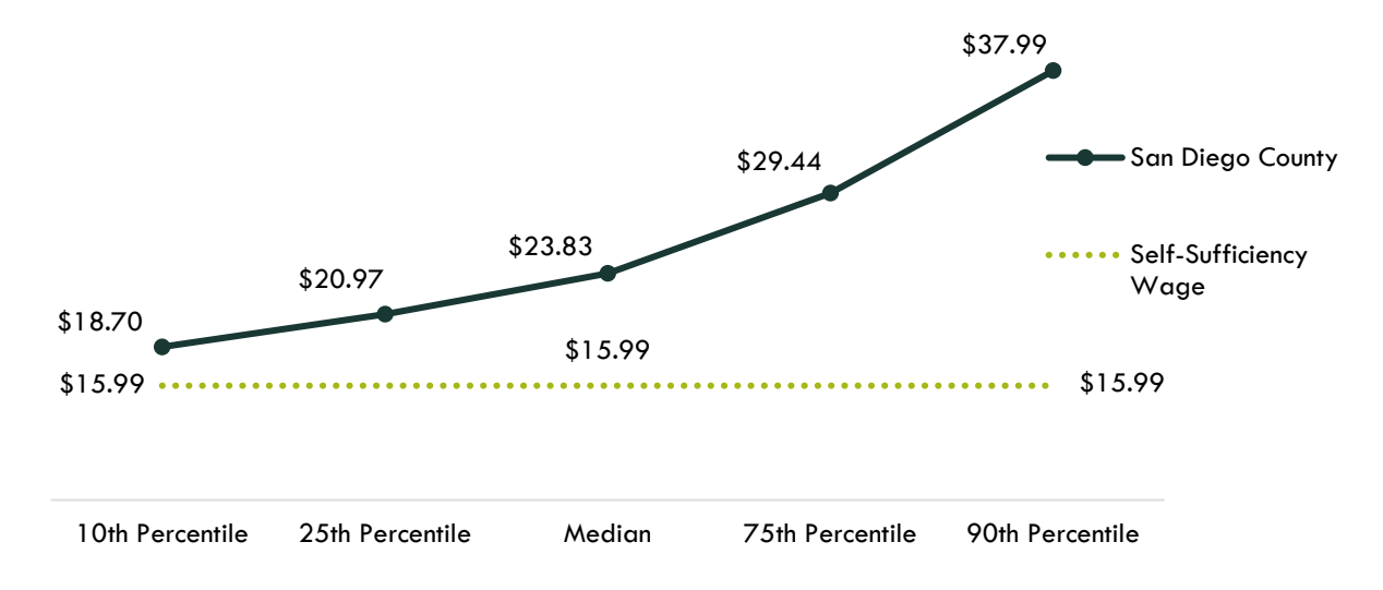
Exhibit 3: Hourly Earnings for Set and Exhibit Designers in San Diego County<sup>5</sup>

Set and Exhibit Designers earn median hourly earnings of $23.83; this is more than the Self-Sufficiency Standard for a single adult in San Diego County, which is $15.99 per hour (Exhibit 3).4